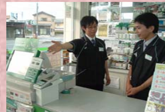
Customer service training