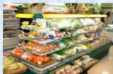
Famima Fresh corners