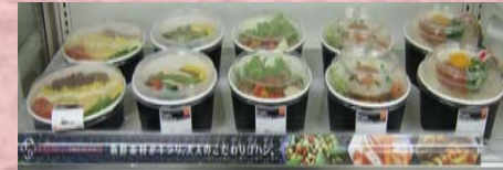
Chilled box lunches